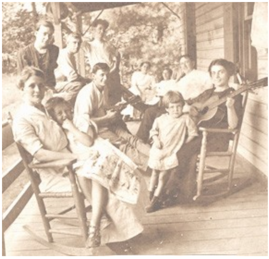
There was music in my mother's house.

There was music all around. There was music in my mother's house and my heart still feels full with the sound.